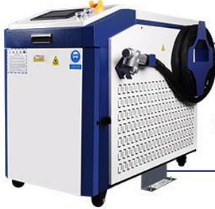
1X CWFL- ANW16 Water Chiller ( For 3000W cleaning machine)