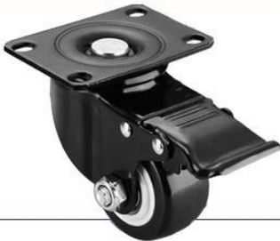
4 X Wheels