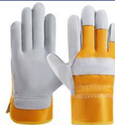
1 Pair Gloves