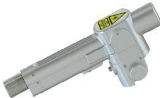
SUP32C laser cleaning gunhead