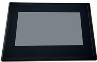
LCD Display Screen