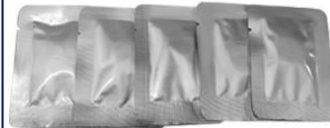
4Pcs Protective lenses