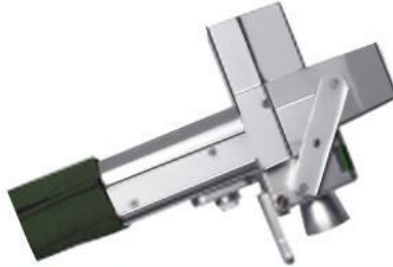
Handheld Laser Cleaning Gun