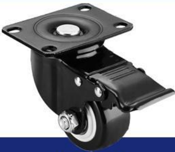
4 X Wheels