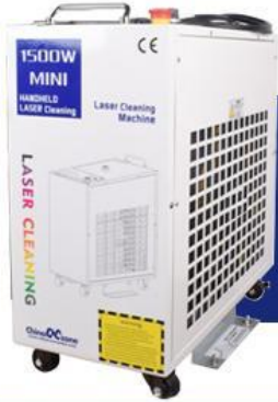
1X CWFL- ANW08 Water Chiller (1 000W/1500W/2000W/3000W Can be selected)