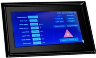
LCD Display Screen