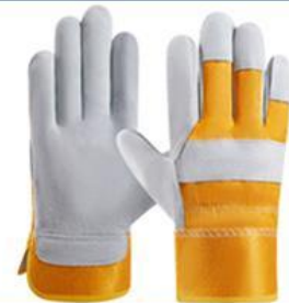
1 Pair Gloves