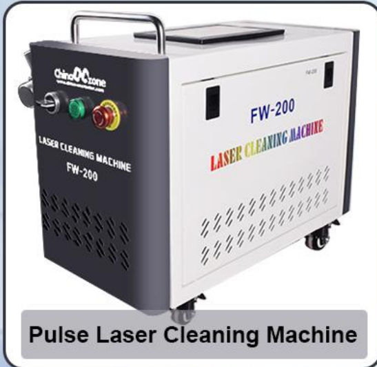
Pulse Laser Cleaning Machine