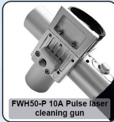
FWH50-P 10A Pulse laser cleaning gun