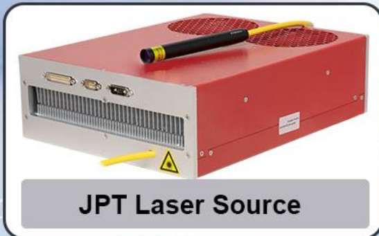
JPT Laser Source