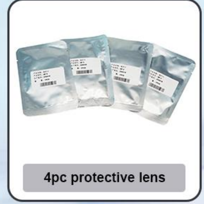
4pc protective lens